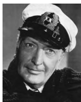
Hans Albers (1891–1960) was a German actor and singer.